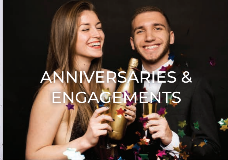
ANNIVERSARIES & ENGAGEMENTS